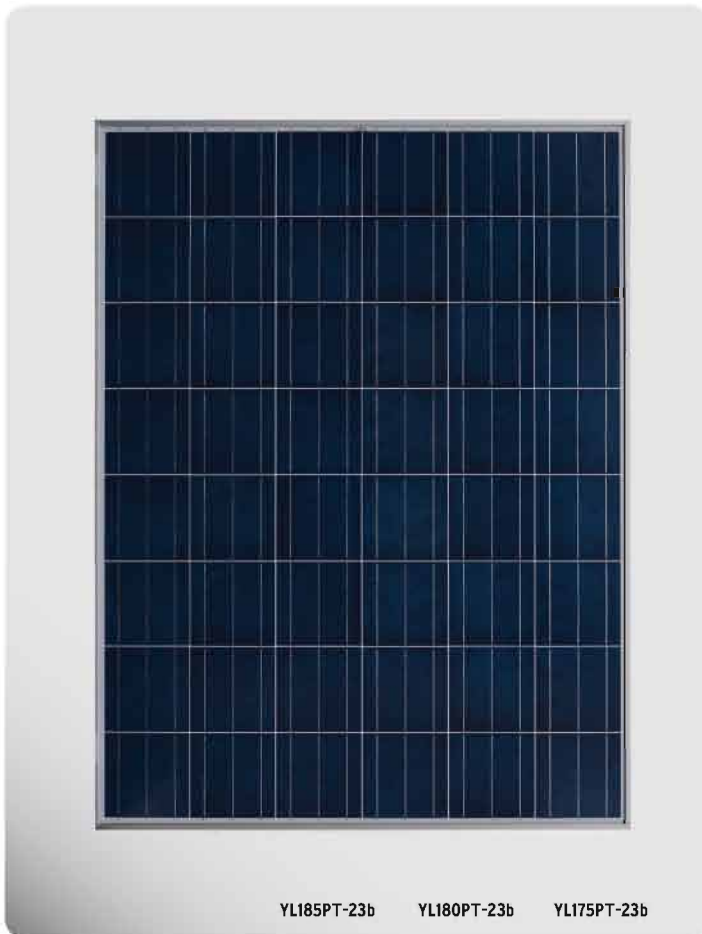
YL185PT-23b YL180PT-23b YL175PT-23b